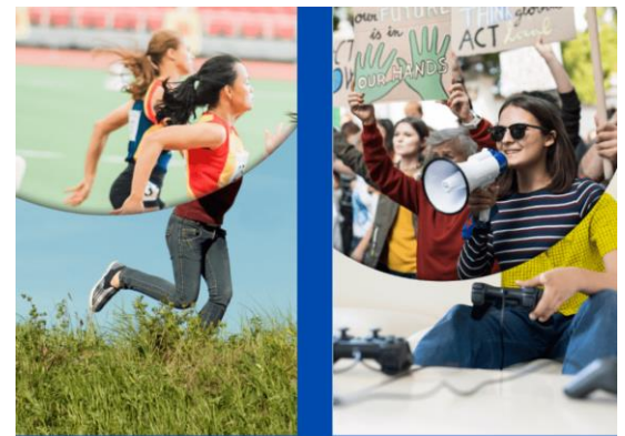
Capacity Building in the field of Youth and Sport for Neighborhood East countries

In particular, through Erasmus+ capacity building actions, youth and sports organizations from the Republic of Moldova will have access to a wider range of training, learning and networking opportunities, giving them the chance to bring change to their communities.