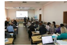
▶ TAM FOR UNIVERSITIES IN MOLDOVA: PROFESSIONAL COMPETENCIES IMPROVEMENT & ICT AND ELEARNING