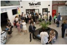
▶ INTERNATIONAL HERE SEMINAR, IN CHISINAU