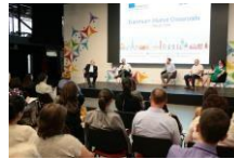
▶ FIRST EDITION OF ERASMUS+ ALUMNI CROSSROADS, IN CHISINAU